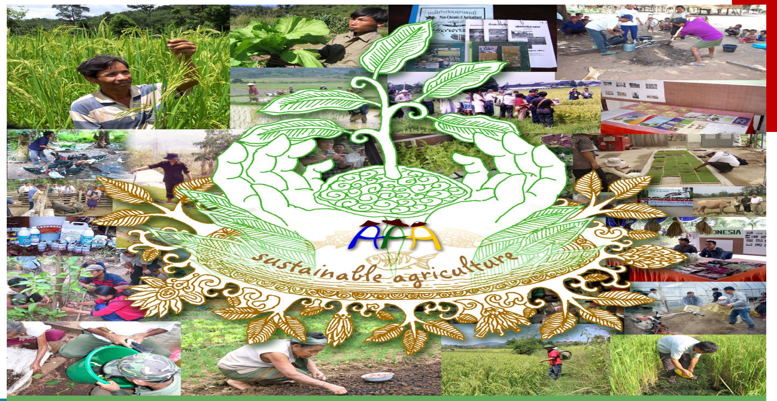
AFA supports and practices various forms and technologies of sustainable agriculture including bio-extract, bio-compost, bio-hormone, use of local and select seeds, herbal pesticides, integrated farming, crop diversification, production of visual aids and tools, fruit tree propagation, fish breeding, village veterinary volunteer services