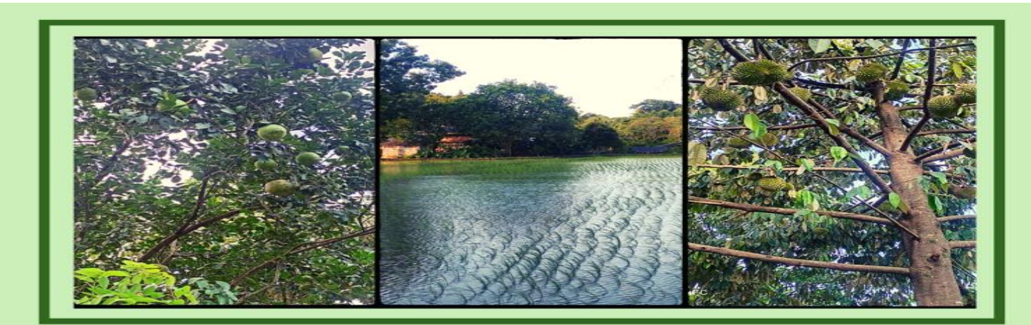
FOOR SECURITY, BIODIVERSITY, HEALTHY SOILS, GOOD FOOD and LANDSCAPE